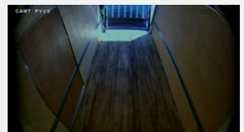
WIDE-ANGLE INTERIOR CAMERA