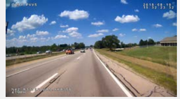
AHD FORWARD-FACING CAMERA

8625 Byron Commerce Dr. SW • Byron Center, MI 49315 • USA p: 616.583.1520 • marketing@provisionusa.com