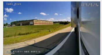
AHD SIDE CAMERA