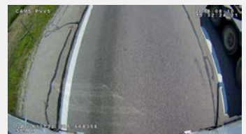
AHD HEAVY DUTY STANDARD CAMERA