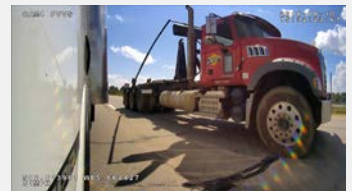
AHD SIDE CAMERA